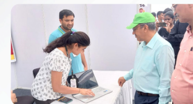
Vendor Development Program