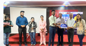
Shark Tank (4 seasons)