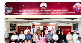
Round Tables on MSME Issues