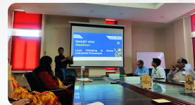
Smart VGU Ideathon (4 seasons)